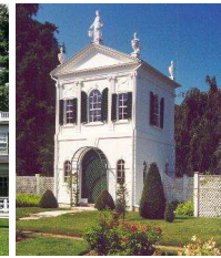
DERBY SUMMER HOUSE