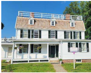
JEREMIAH PAGE HOUSE

We ask that you renew your membership at your current level or higher for the year 2025. With your help, we can continue our work as the guardian of these historically important buildings, and much more!