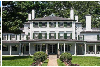
GLEN MAGNA FARMS